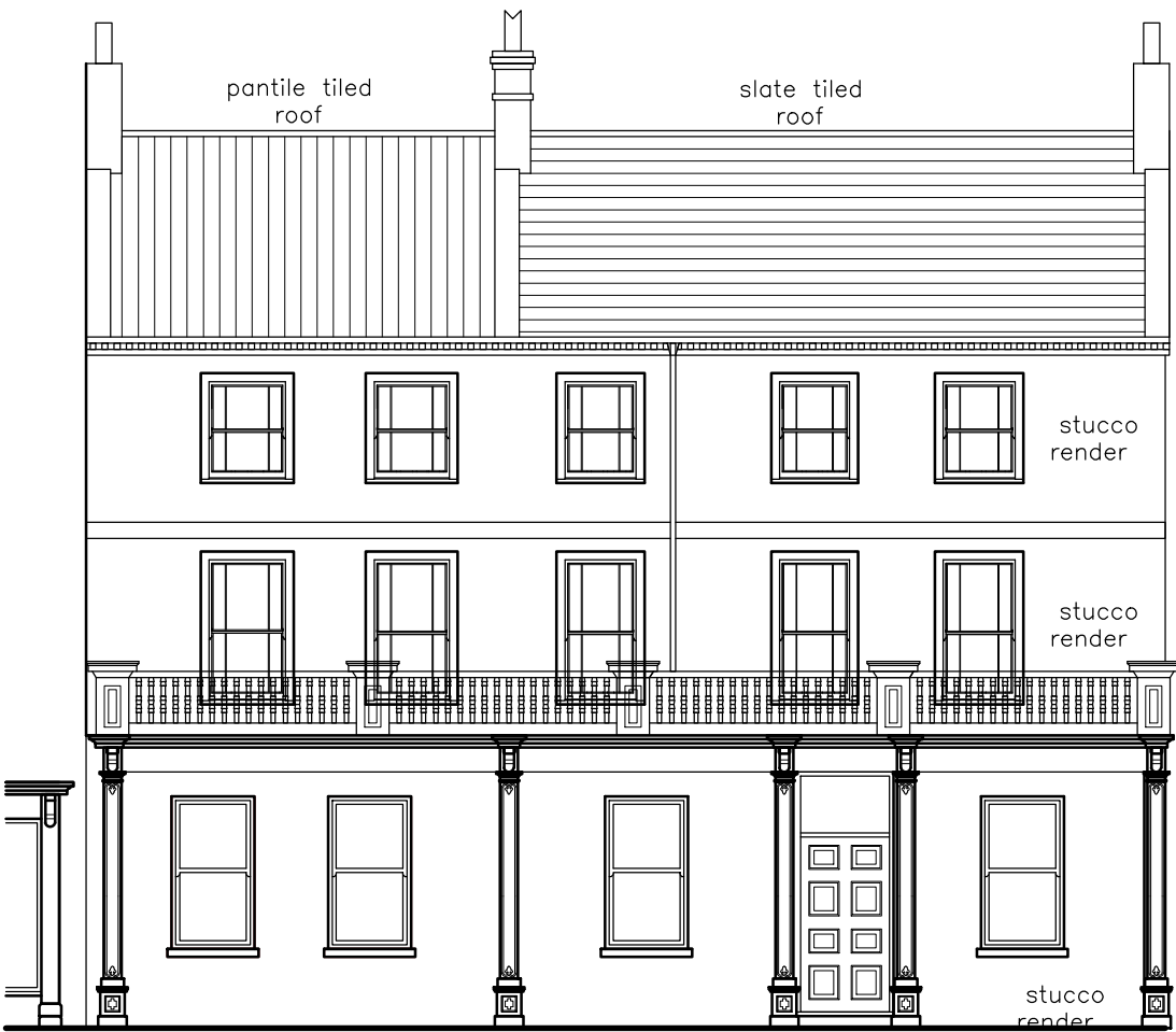
FRONT ELEVATION (WIDE BARGATE)