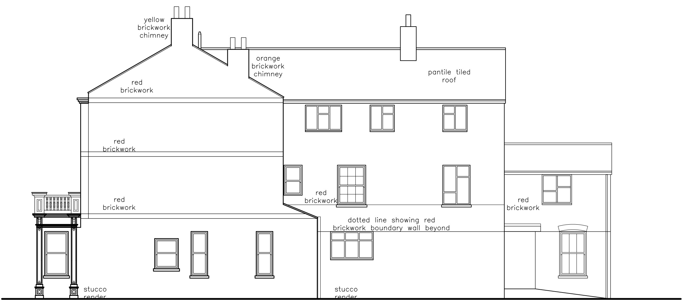
SIDE ELEVATION (THEADNEEDLE STREET)