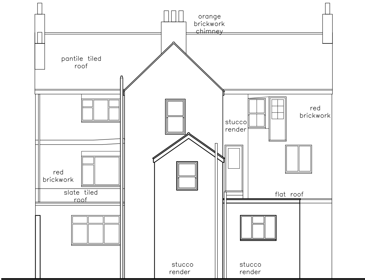
REAR ELEVATION (SOUTH EAST)